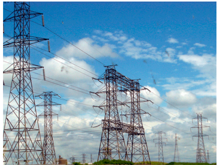
China's electricity can keep flowing as long as it continues to obtain sufficient energy sources.

to exploit other resources. Drawing almost 14 percent of its energy from hydroelectricity, the country plans to dam up all five of Asia's major rivers in order to keep its generators going. China has helped drive up the price of uranium with its plans to dramatically increase its nuclear energy program.