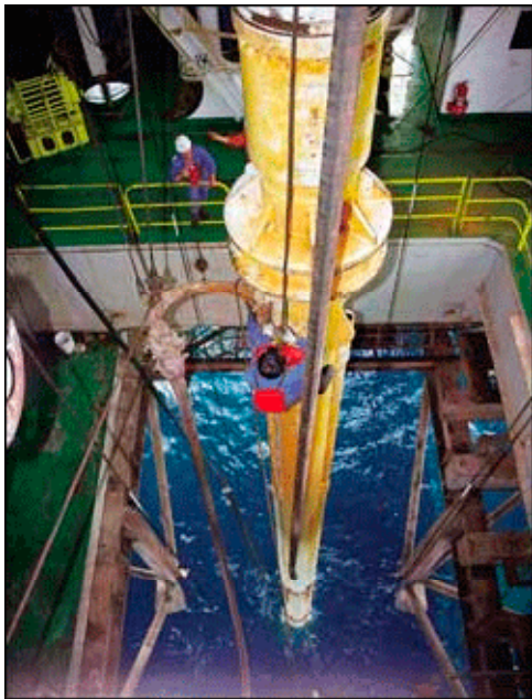
Husky Energy's deep water gas discovery could generate more aggressive exploration